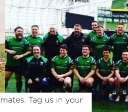
Christians in sport sharing life and the gospel with teammates. Tag us in your sporting photos on social media, we'd love to see them!