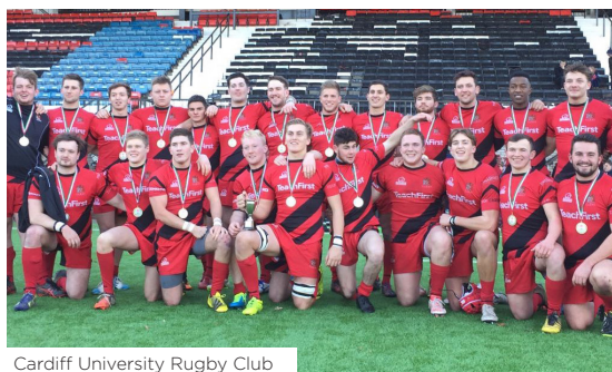
Cardiff University Rugby Club

I spoke to the social secretary before my first social to let him know I was a Christian and did not believe in excessive drinking, but made it clear I still wanted to be involved. Soon, most of the rugby club knew I was a Christian and said they really respected me for still coming to socials. It also gave me chance to talk about my faith. In the pub, one of the other freshers said "you've inspired me to stop drinking". I was so surprised, especially in that environment, but it was during our mission week at the uni so I invited him to the event the next day. He was very